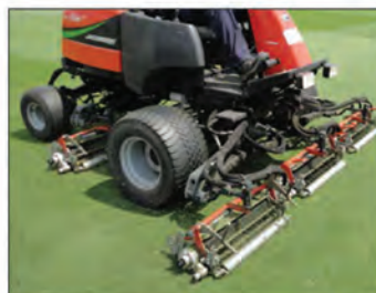
5 GANG GREENS MOWERS