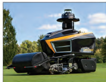
RG3 ROBOTIC MOWERS