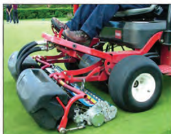
3 GANG GREENS MOWERS